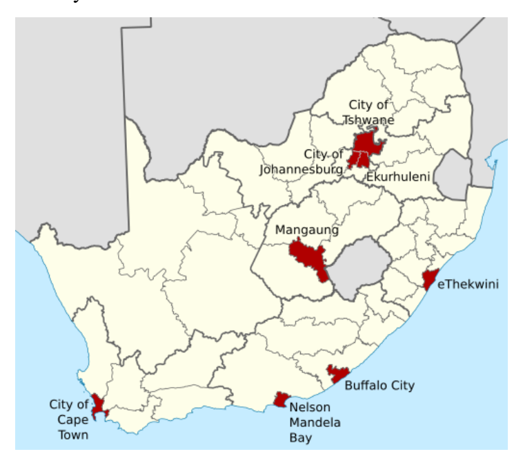
Figure 2: Location of South African metropolitan municipalities

This study follows a qualitative approach with a multiple case study design, focusing on specific metropolitan municipalities in South Africa. Figure 2 depicts the location of the eight metropolitan municipalities in the country.