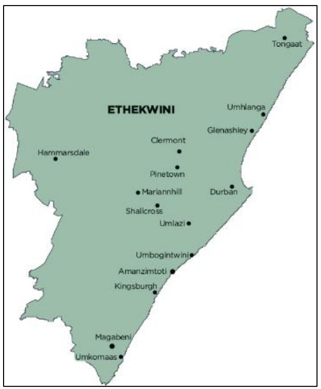
Figure 4: eThekwini Municipality's municipal boundary

Africa, 2023b) and an unemployment rate of 22%, compared to the national rate of 32.9% (Statistics South Africa, 2024). Figure 4 shows eThekwini Municipality's municipal boundary.