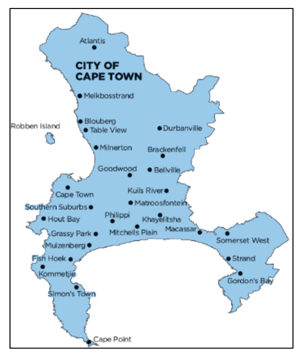
Figure 3: City of Cape Town municipal boundary

The City of Cape Town is located on the southern peninsula of the Western Cape province and consists of an area of 2 441 km<sup>2</sup> (Main, 2024). It is South Africa's second-largest economic hub, second most populous city (Main, 2024), and home to 4 772 846 people (Statistics South Africa, 2023b). The municipality has an unemployment rate of 23,9%, compared to 32.9% nationally (Statistics South Africa, 2024). Figure 3 shows the City of Cape Town's municipal boundary.