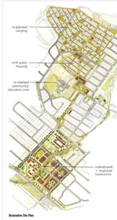
Collaborative planning with communities — informal settlement upgrading (Class of 2012)