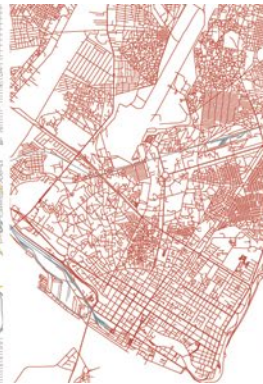
MAPUTO 25°58'S 32°34'E