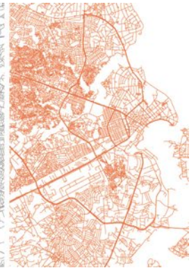
DAR ES SALAAM 6°49'S 39°17'E