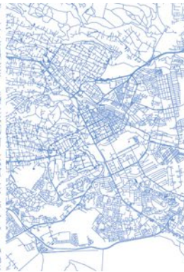
NAIROBI 01°17'S 36°49'E