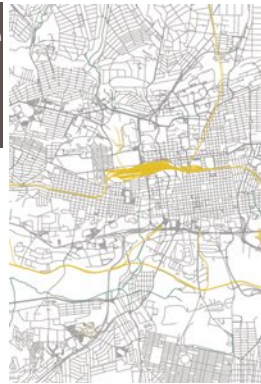
JOHANNESBURG 26°12'S 28°2'E