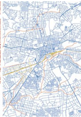
HARARE 17°49'S 31°3'E