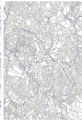
ADDIS ABABA 9°1'N 38°45'E