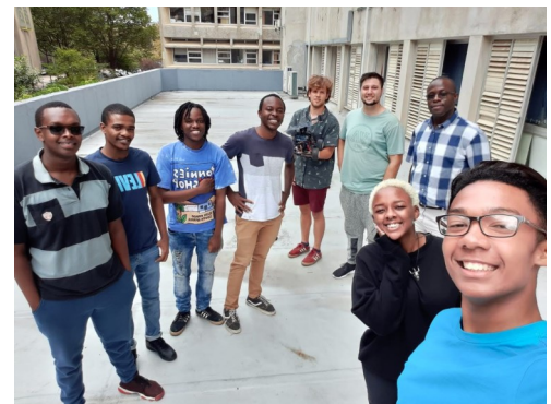
2020 IEEE team