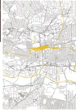
JOHANNESBURG 26°12'S 28°2'E