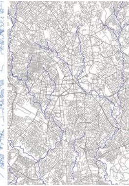
ADDIS ABABA 9°1'N 38°45'E