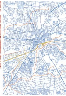
HARARE 17°49'S 31°3'E