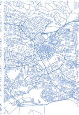
NAIROBI 01°17'S 36°49'E